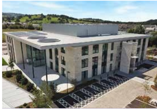
Ecclesiastical's office in Gloucester

Ecclesiastical Planning Services works with funeral directors across the country. It is part of the Benefact Group which is a family of award-winning, specialist financial services businesses that, from its profits, gives to good causes in order to transform lives and communities.