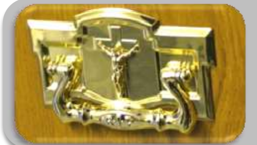
R.I.P. Brass Effect £45 per set