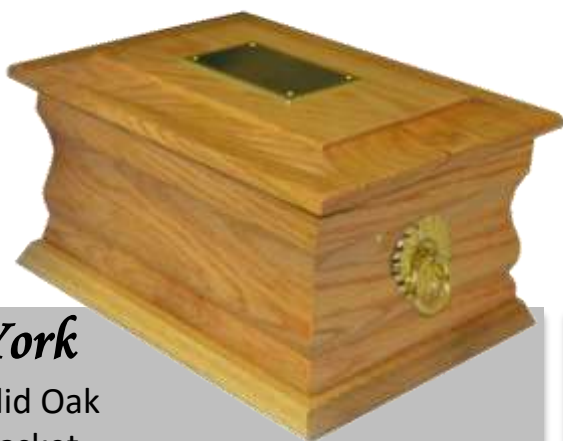
York Solid Oak Casket £70

If arrangements are to be made for the interment of cremated remains, a £25 arrangement fee will be added to the cost of the casket.