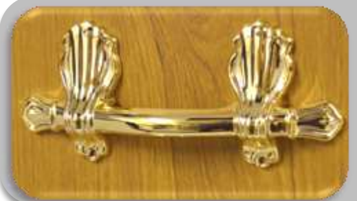
York Brass Effect £25 per set