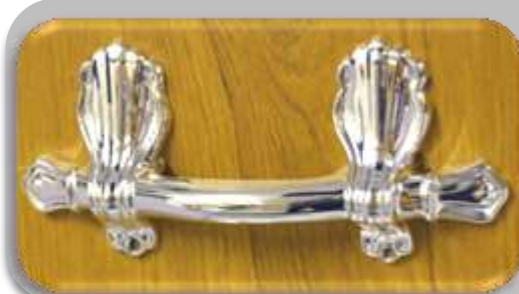
York Silver Effect £25 per set

All of the coffins and caskets illustrated here are shown with either Silver effect or Brass effect plastic handles which conform to cremation regulations. If the funeral is to be a burial, we recommend the use of metal handles to give added strength.