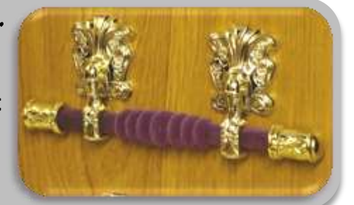
Purple Bar Oscar Brass Effect £125 per set