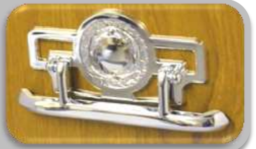
Laurel Silver Effect £45 per set