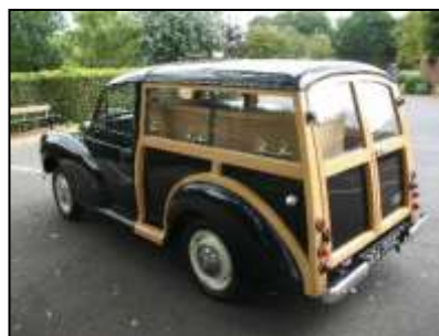
Morris Minor Hearse £600