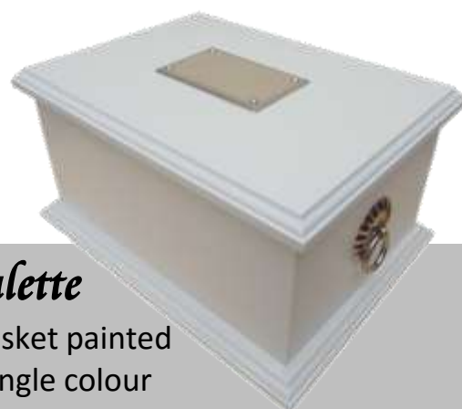
Palette Simple Casket painted in any single colour £75