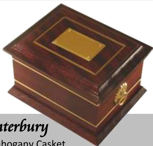
Canterbury Solid Mahogany Casket with Gold Coloured Inlay £80