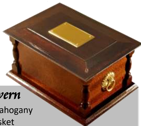
Malvern Solid Mahogany Casket £80