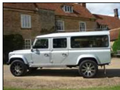
Landrover Hearse – £775. 8 seater following vehicle £650