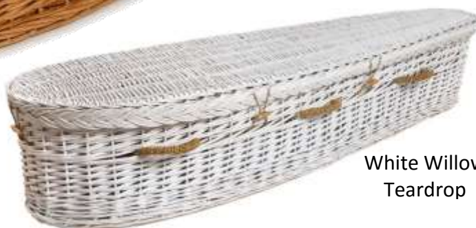
White Willow Teardrop

A range of woven coffins designed by Tributes and crafted in the UK and other parts of the world.