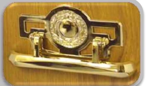
Laurel Brass Effect £45 per set