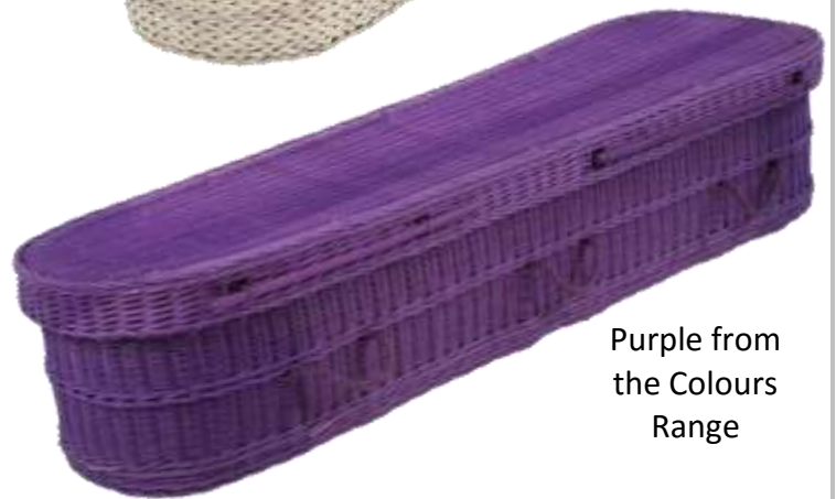
Purple from the Colours Range

The Colours range of coffins uses natural dyes to create unique coffins in a range of bold colours.