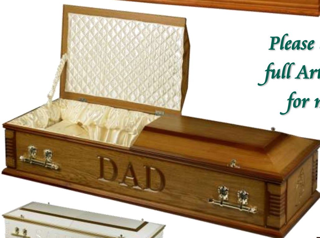
Premier Casket with Hinged Lid £950