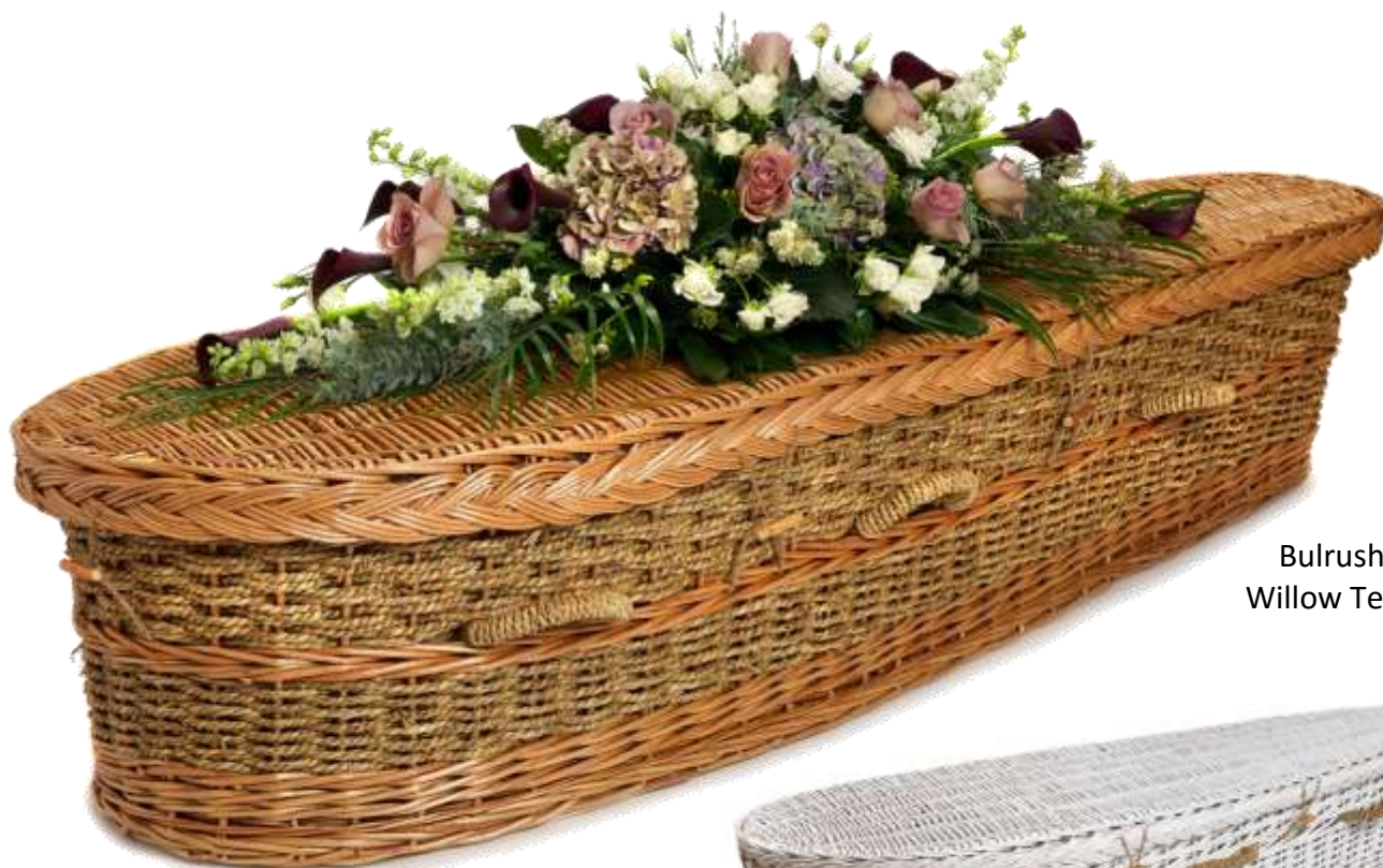
Bulrush and Willow Teardrop