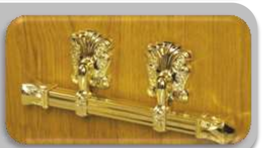
Stanley Brass Effect £90 per set