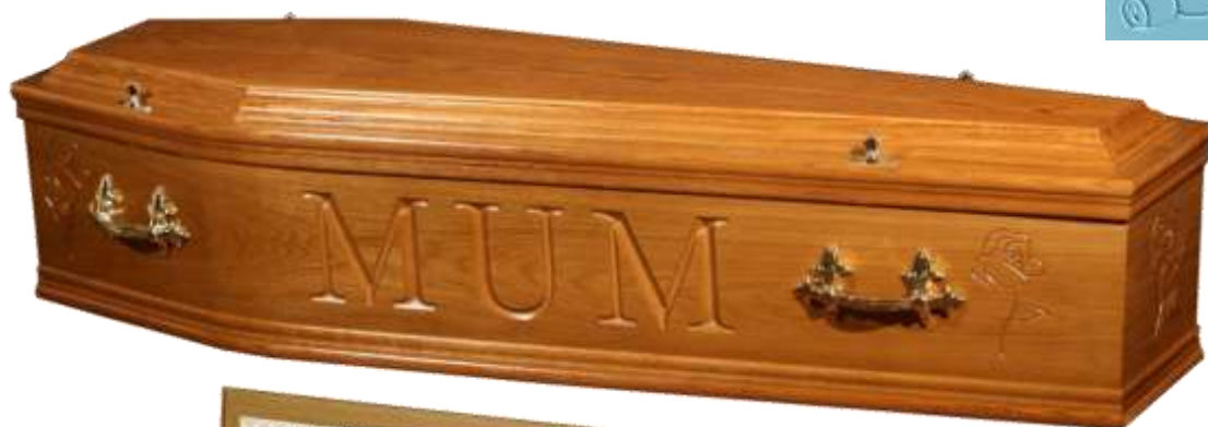
Artiste Coffin £675