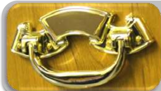
Lyme Brass Effect £65 per set