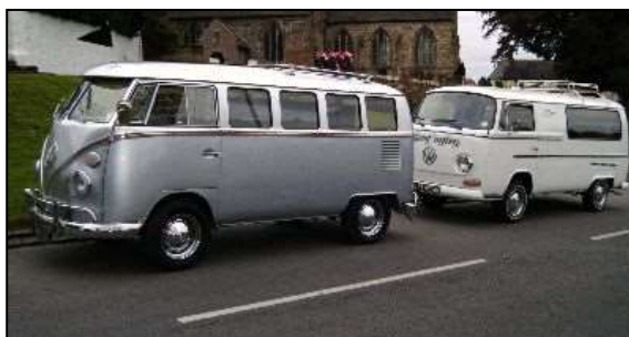
VW Campervan hearse – from £525 5 seater following vehicle from £500