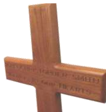
Custom Engraved Grave Cross