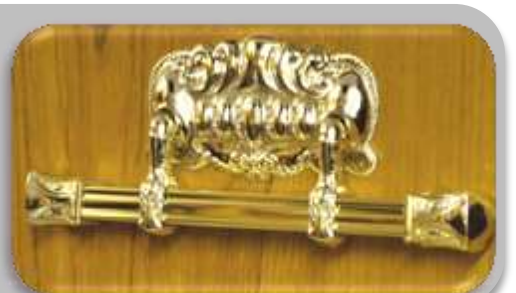
Oscar Brass Effect £100 per set

A Cross or Crucifix can be added to any coffin at no additional cost (Cross only available in Brass effect)