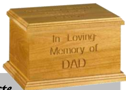
Artiste With custom engraving in a medium Oak or Mahogany finish, or painted any single colour. £100