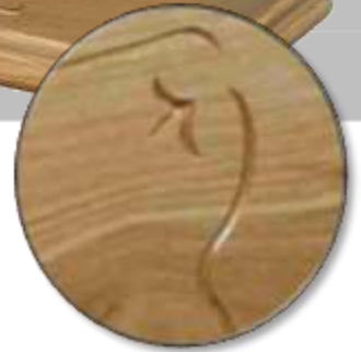
Decorative panel detail