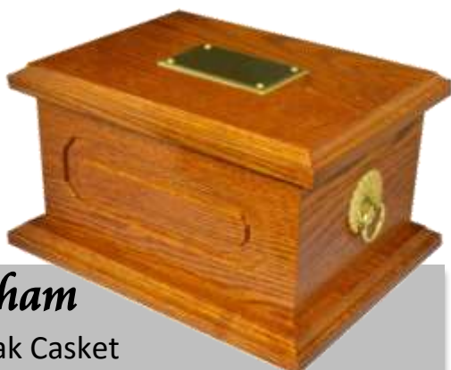
Evesham Solid Oak Casket with Medium Oak finish £80