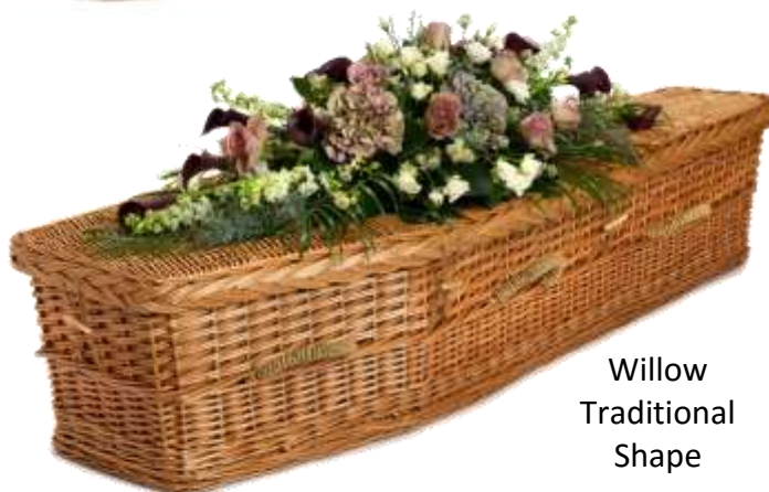
Willow Traditional Shape

All coffins are made from natural materials with no metal or plastic, and are available in either a teardrop or a traditional coffin shape.